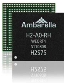
The 14 nm Ambarella H2 (H2S75) SoC Device.

A unique architecture and 14-nm process technology minimizes H2 power consumption while maximizing performance.